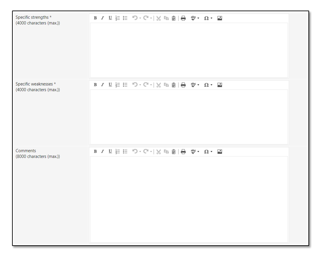
Figure 1: Screenshot of comment fields.